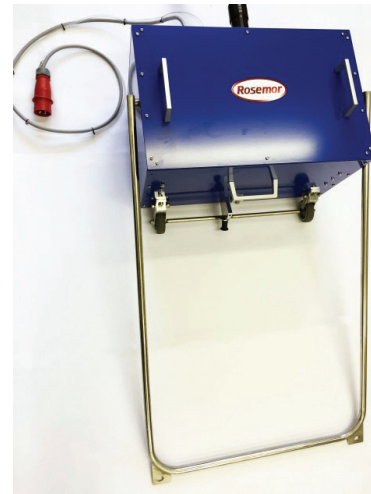
The T10 attachment for the Rotomac ET15B