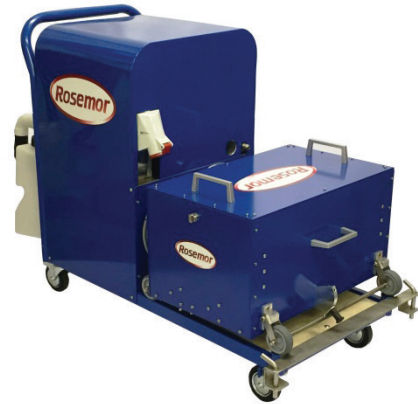
The T10i, which includes the T10